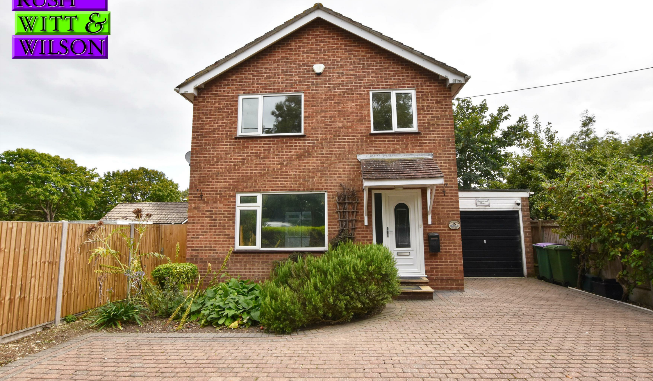
Ravensbrook House Station Road, New Romney, Kent TN28 8LQ Guide Price £389,950